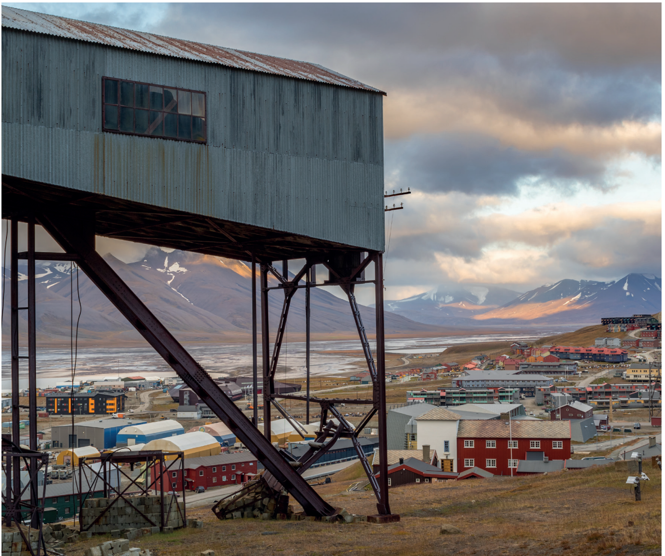
Coal mining infrastructure in disuse, Svalbard

The need for a managed transition away from fossil fuel production raises the question of whether and how countries are addressing this need in their national communications to the UN Framework Convention on Climate Change (UNFCCC). A previous 2019 analysis of the first round of nationally determined contributions (NDCs) and long-term, low-emissions development strategies (LT-LEDS) found that few countries discussed how they would address fossil fuel production as part of their climate mitigation activities. Here, we examine new and updated NDCs and LT-LEDS, finding a growing number of NDCs and LT-LEDS that address fossil fuel production as part of mitigation. For the first time, several countries incorporate policies and/or pathways for a managed decline of fossil fuel production. In contrast, many others foresee continued or expanded fossil fuel production, with no mention of efforts to prepare for a transition. Opportunities remain for countries to make better use of NDCs and LT-LEDS to align fossil fuel production with the Paris Agreement, including by more comprehensively reflecting on the equity implications of their plans, as well as addressing how countries plan to diversify their economies, ensure a just transition for workers, and cooperate internationally on a managed wind-down of fossil fuel supply. As COP26 approaches, this window of opportunity is still open, but it is rapidly closing.