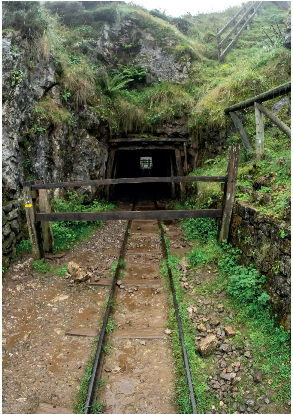
Entrance to closed mine

We searched the content of the 38 NDCs and 11 LT-LEDs for references to fossil fuel production or related terms, using the following search terms: “coal”, “economic diversification”, “extract”, “fossil”, “fuel”, “gas”, “hydrocarbon”, “just transition”, “lignite”, “mine/mining”, “oil”, “petroleum”, “producer”, “production”, “subsidy/ies”, and “supply”. The results were examined to verify that they concerned fossil fuel supply, and were then analysed for context. In addition, we read through all the documents to ensure no references were missed.