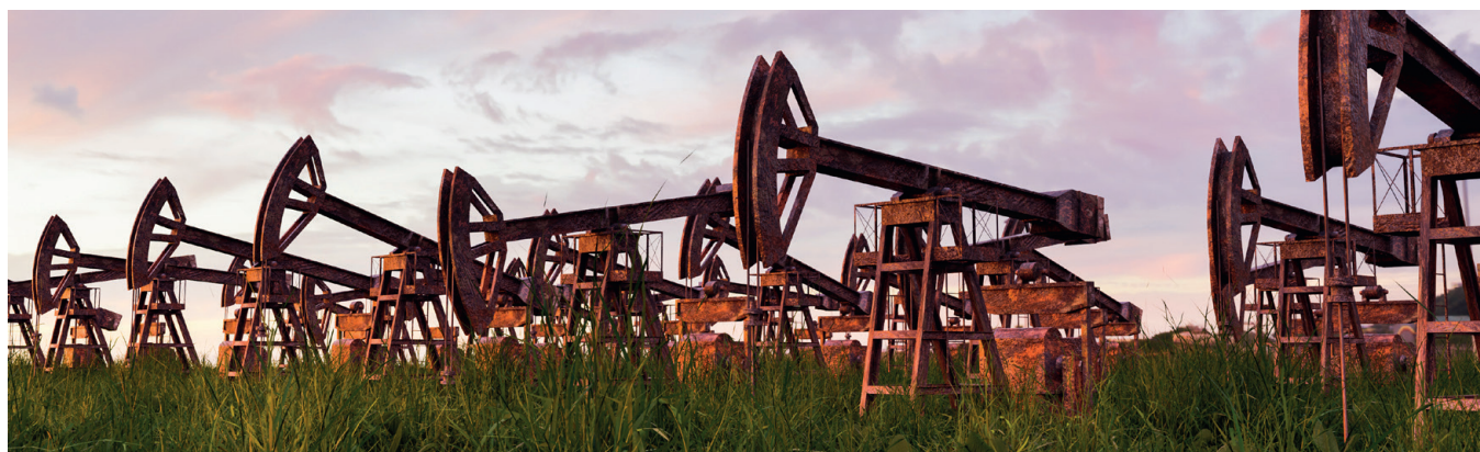
Oil pumps

This analysis does not include policies from countries that have enacted supply-side measures but not yet included them in their NDCs and LT-LEDs. These include, among others, measures to restrict the leasing of state-owned lands and waters for fossil fuel development, cease public financing of fossil fuel production, limit the development of specific infrastructure, and divest public funds from fossil fuel holdings (for a more comprehensive list of measures see Lazarus and van Asselt (2018)).