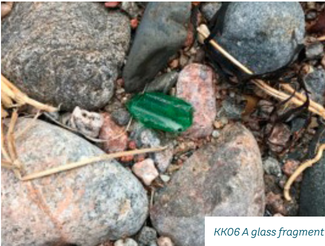
KK06 A glass fragment