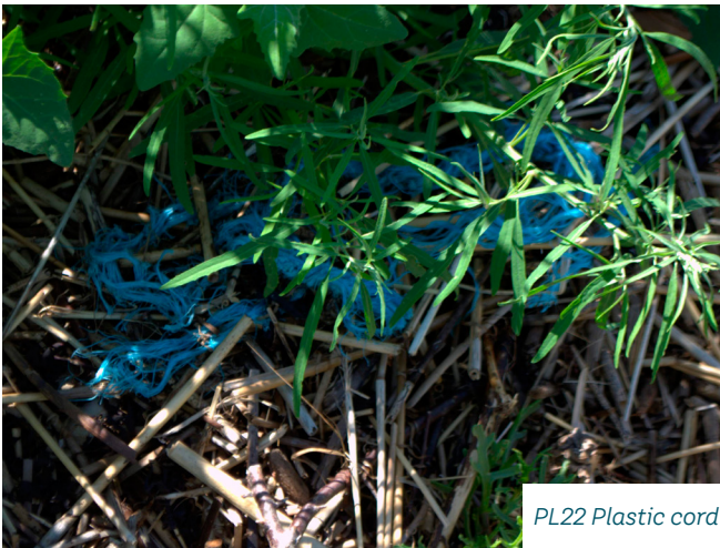
PL22 Plastic cord