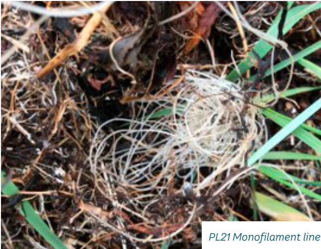
PL21 Monofilament line