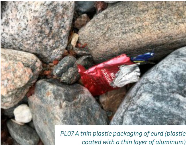
PL07 A thin plastic packaging of curd (plastic coated with a thin layer of aluminum)