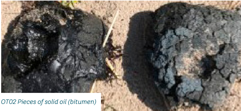
OT02 Pieces of solid oil (bitumen)