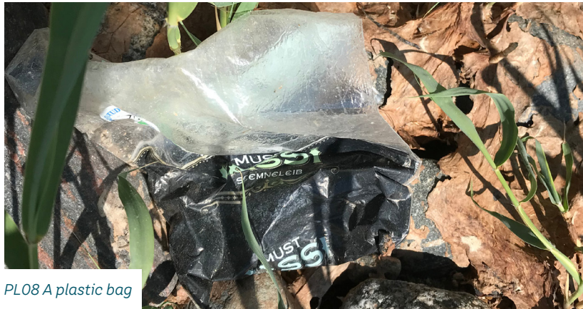
PL08 A plastic bag