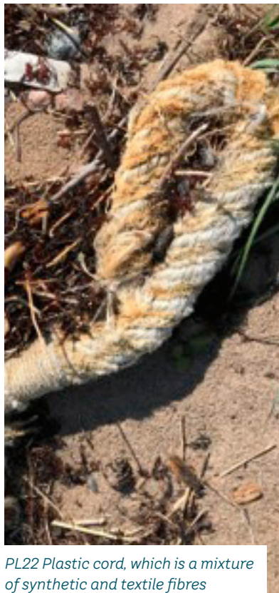
PL22 Plastic cord, which is a mixture of synthetic and textile fibres