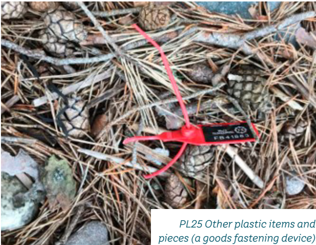
PL25 Other plastic items and pieces (a goods fastening device)