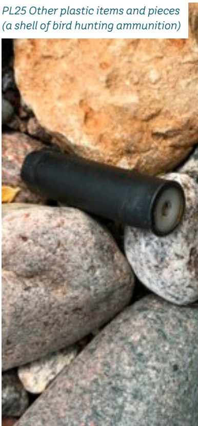
PL25 Other plastic items and pieces (a shell of bird hunting ammunition)