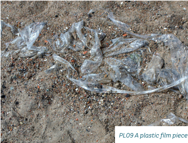
PL09 A plastic film piece