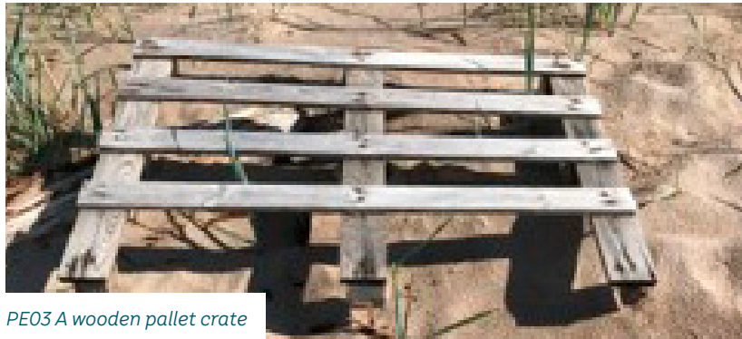
PE03 A wooden pallet crate