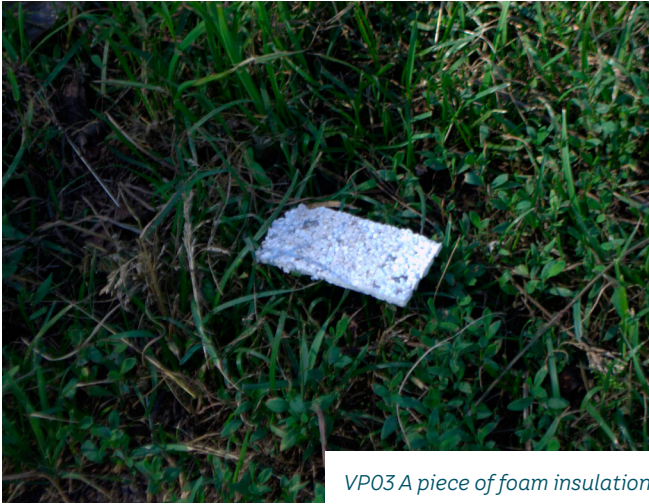
VP03 A piece of foam insulation