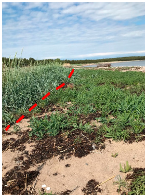
Photo 2. Wave exposure boundary along Mustamäe Beach on Aegna Island