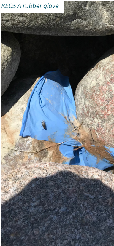
KE03 A rubber glove