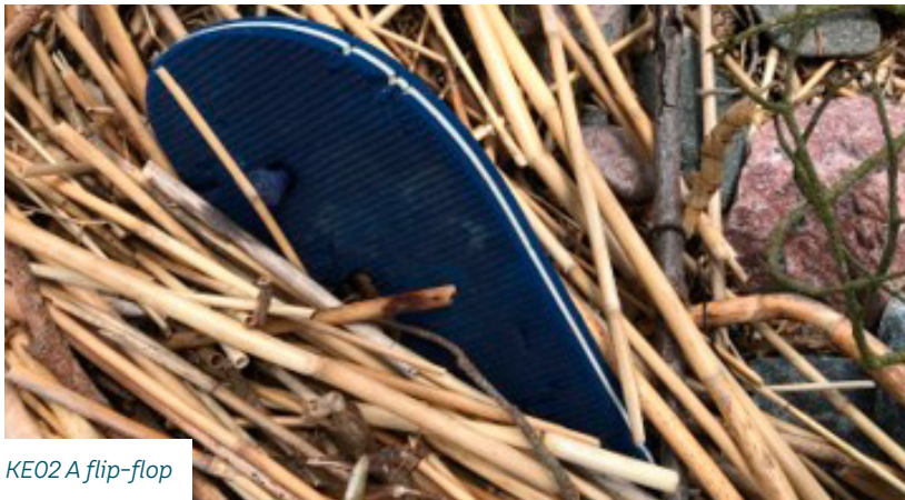
KE02 A flip-flop