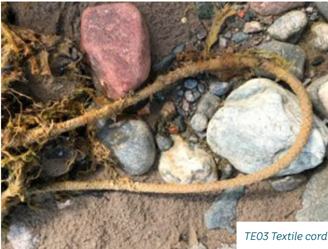
TE03 Textile cord