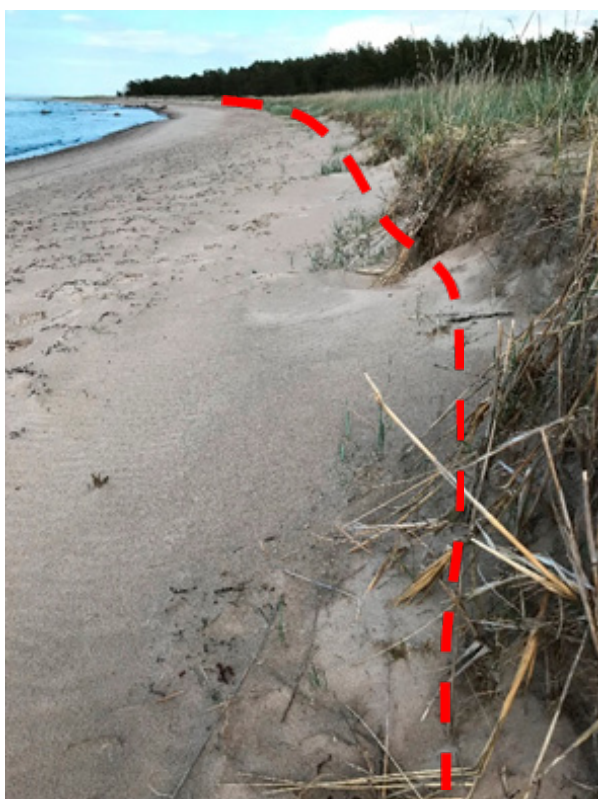
Photo 1. Wave exposure boundary on the North Beach of Aegna Island