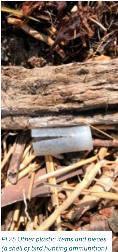
PL25 Other plastic items and pieces (a shell of bird hunting ammunition)