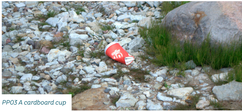
PP03 A cardboard cup