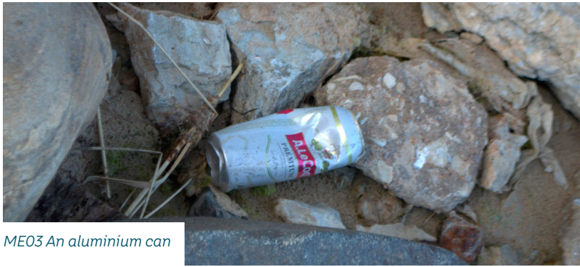
ME03 An aluminium can